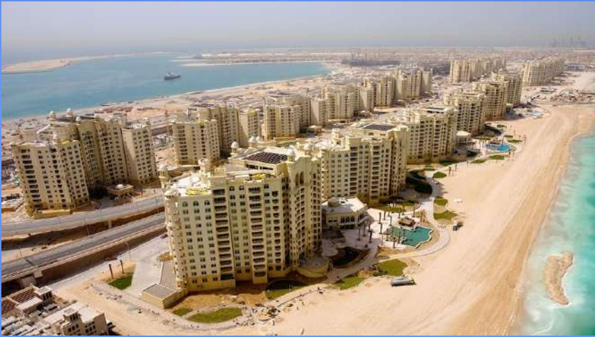
Shoreline Apartment Palm Jumeirah - DUBAI