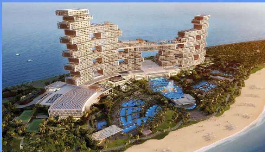
The Royal Atlantis-DUBAI