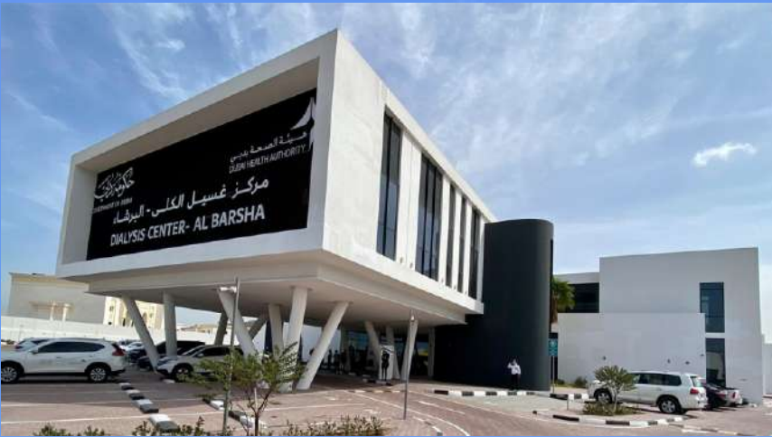
Dialysis Centre - AL Barsha- DUBAI