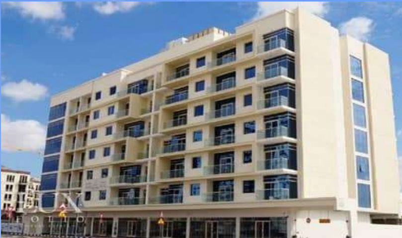
Residential Building AL Barsha - DUBAI