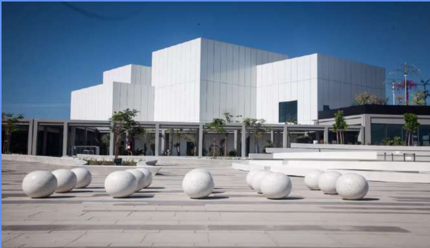
Jameel Art Centre - DUBAI