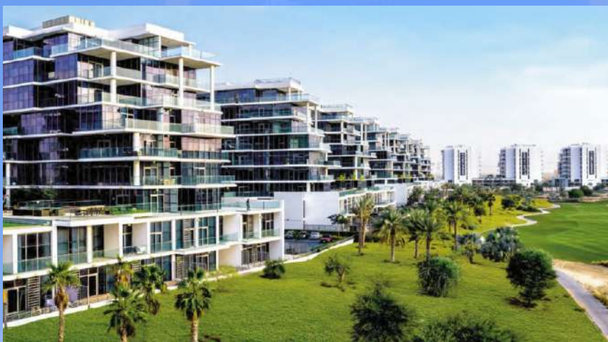
Golf Vita Residential Tower-DUBAI