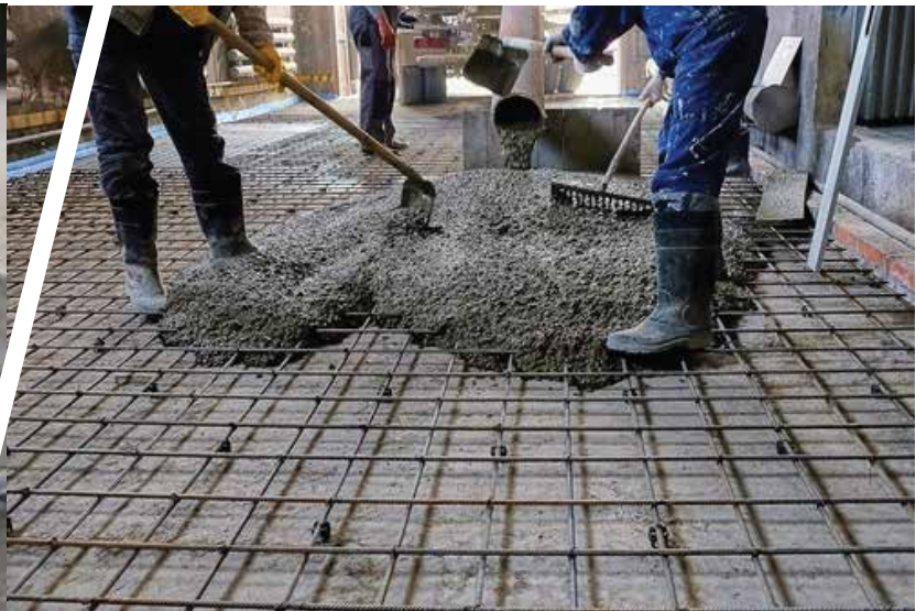
WATERPROOFING LIQUID ADMIXTURE