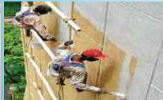
Exterior Latex Wall Primer