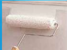
Interior PVA Wall Primer